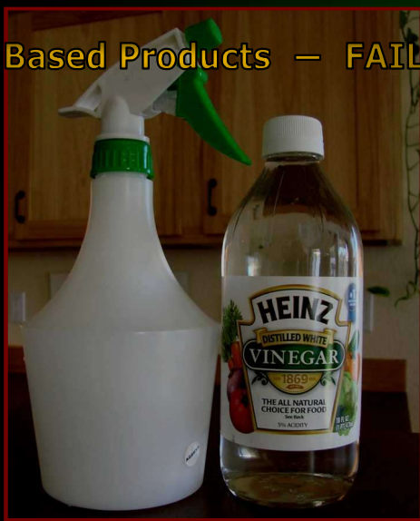
Vinegar-Based Products — FAILURE