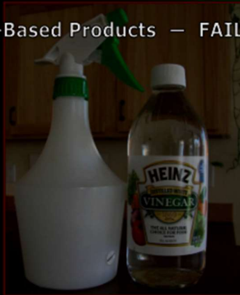
Vinegar-Based Products — FAILURE