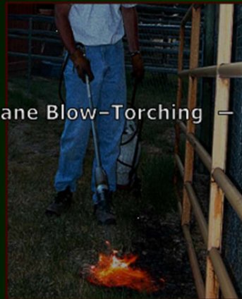
Propane Blow-Torching — FAILURE