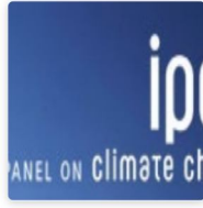
Real Climate Science the IPCC Doesn't Want You to See