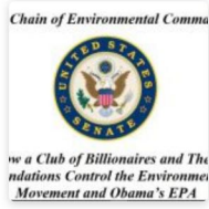
Pretend Conservatives for Not-So-Clean Energy