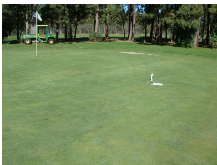
Note the amount of dark green T-1 or Alpha creeping bentgrass compared to the lighter green Poa annua at an interseeded Downriver Golf Course practice putting green in Spokane, WA. Picture taken 1 September 2008. Previously this shady green was nearly 100% Poa .

Interseeding is not as simple as throwing out any bentgrass seed, and expecting bentgrass to overrun Poa annua . Aside from selecting competitive cultivars like T-1 and Alpha , a critical first step in a successful interseeding program is seeding at the right time of year.