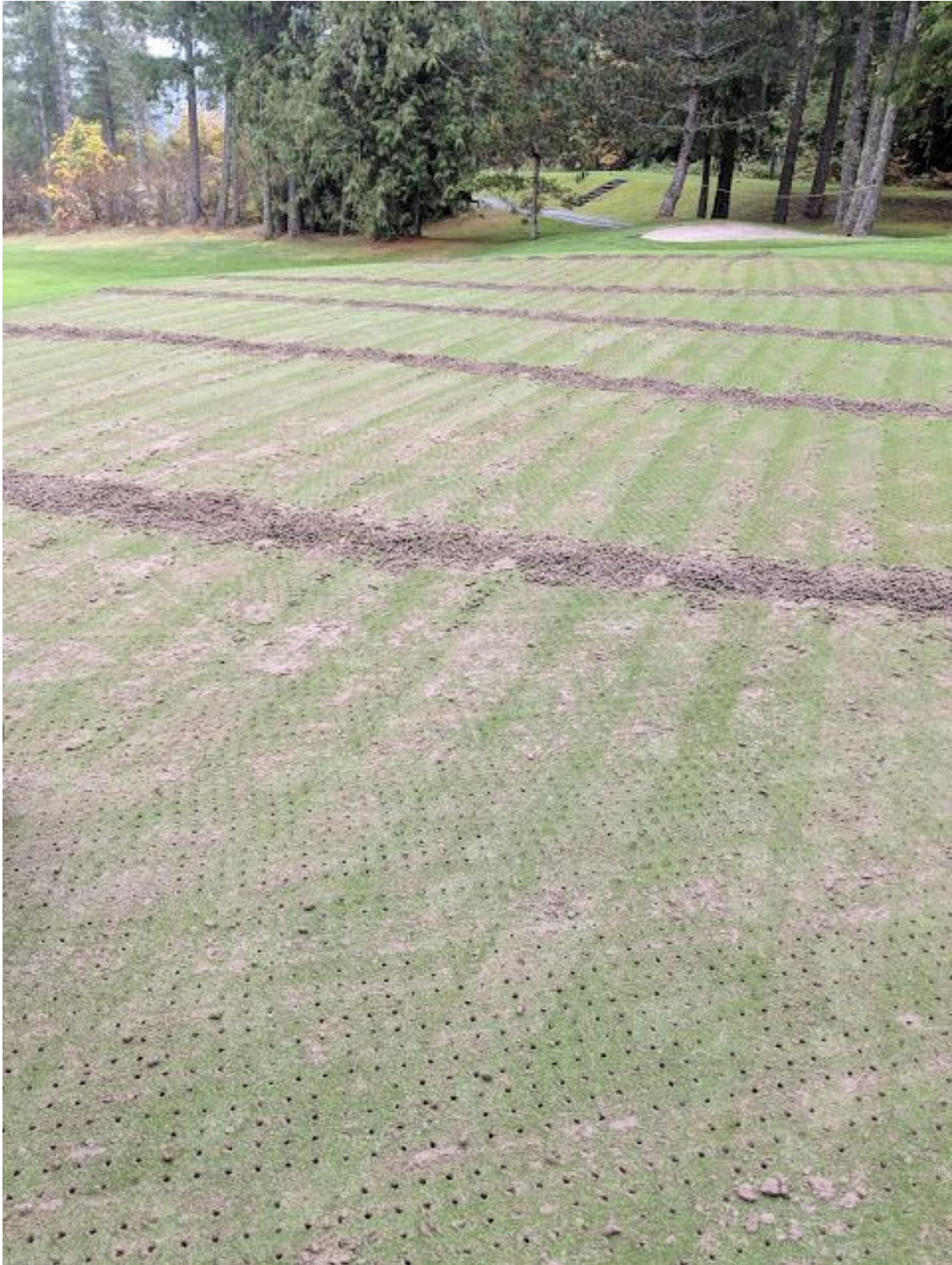
First core on greens in over 4 years