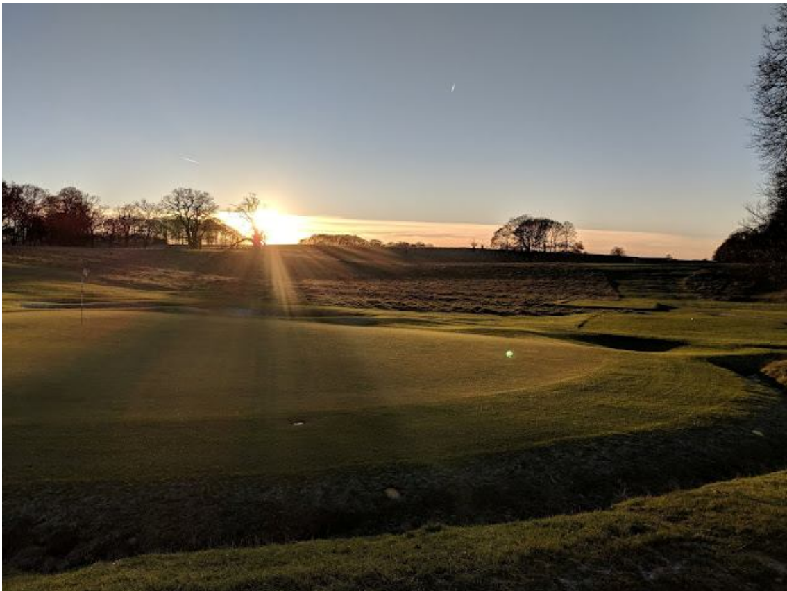
The Royal Copenhagen Golf Club was pure and disease free despite only being allowed 1 fungicide application per year

I started doing this last year and now have a clear plan of what needs to be done. I can take this data to my membership and make a plan to fix this green once and for all.