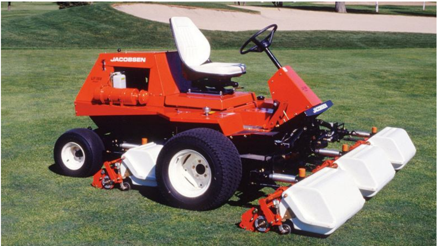
In 1989 the legendary LF-100™ is introduced.

1986 – The industry's first Turf Groomer™ is introduced by Jacobsen and serves as a major advancement in greens care by increasing green speed without lowering the height-of-cut.