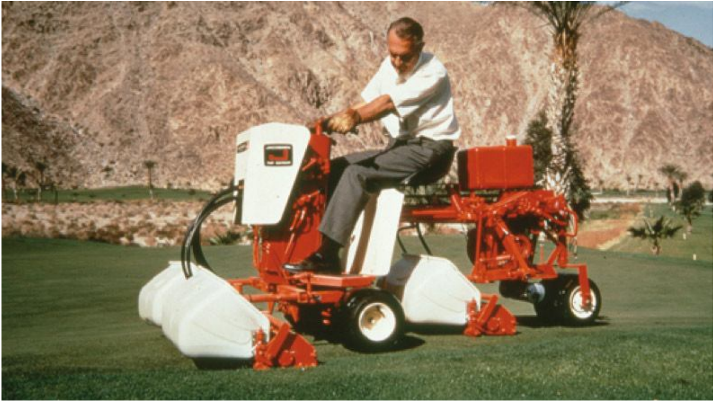
Jacobsen produces the world's first riding greens mowers in 1968 – the Greens King.

1968 – Jacobsen leads the way by producing the world's first riding greens mower, the Greens King™, which becomes the standard of the turf maintenance industry.