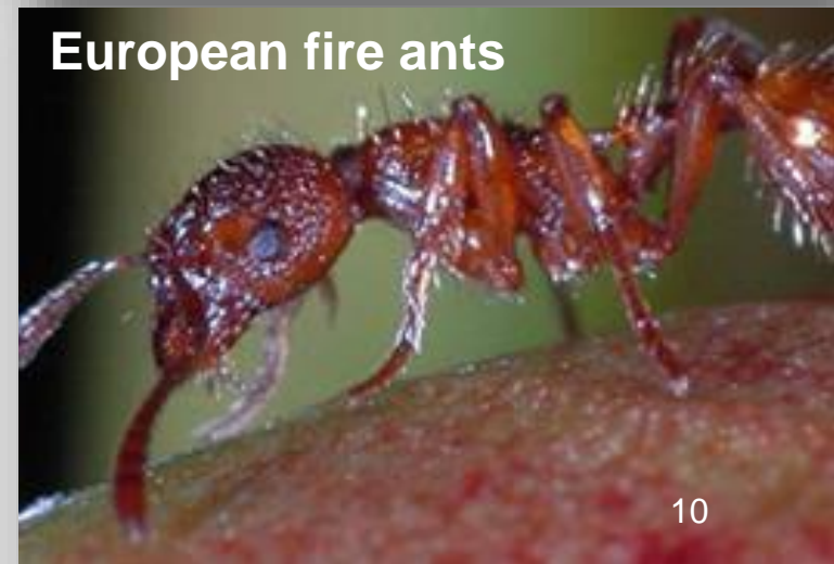
European fire ants