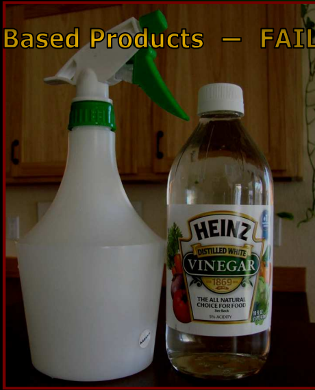
Vinegar-Based Products — FAILURE