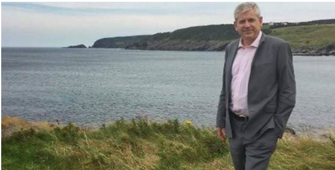
Ontario NDP MP Charlie Angus has often stood up for the rights of Indigenous peoples

"Charlie understands that the fight for environmental justice is intricately tied to social justice and we can't have either without ensuring there is Indigenous justice," Suzuki continued. "The solution will not be met by dividing people, by making winners and losers, but through bringing people together."