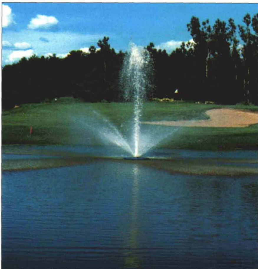
Hole #8, the signature hole at Cedarbrook.

that we have found to be extremely effective. Tees are being resodded to newer dwarf Kentucky Bluegrass varieties to better withstand the severity of the Quebec winters.