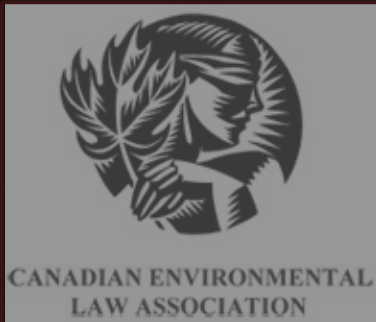
CANADIAN ENVIRONMENTAL LAW ASSOCIATION (C.E.L.A.)