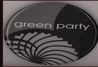
GREEN PARTY OF ONTARIO