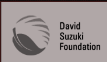
DAVID SUZUKI FOUNDATION