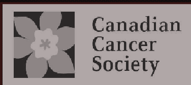
CANADIAN CANCER SOCIETY (C.C.S.)