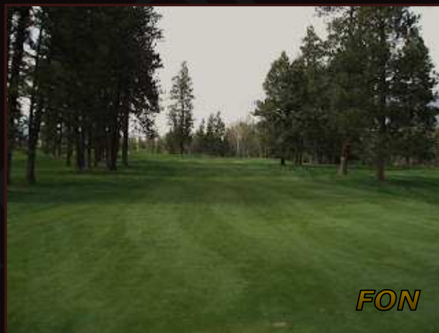
No. 8 Fairway : Treated