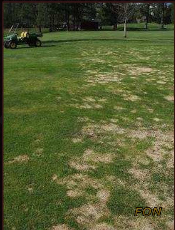
No. 4 Fairway

The following pictures are from No. 8 Fairway.