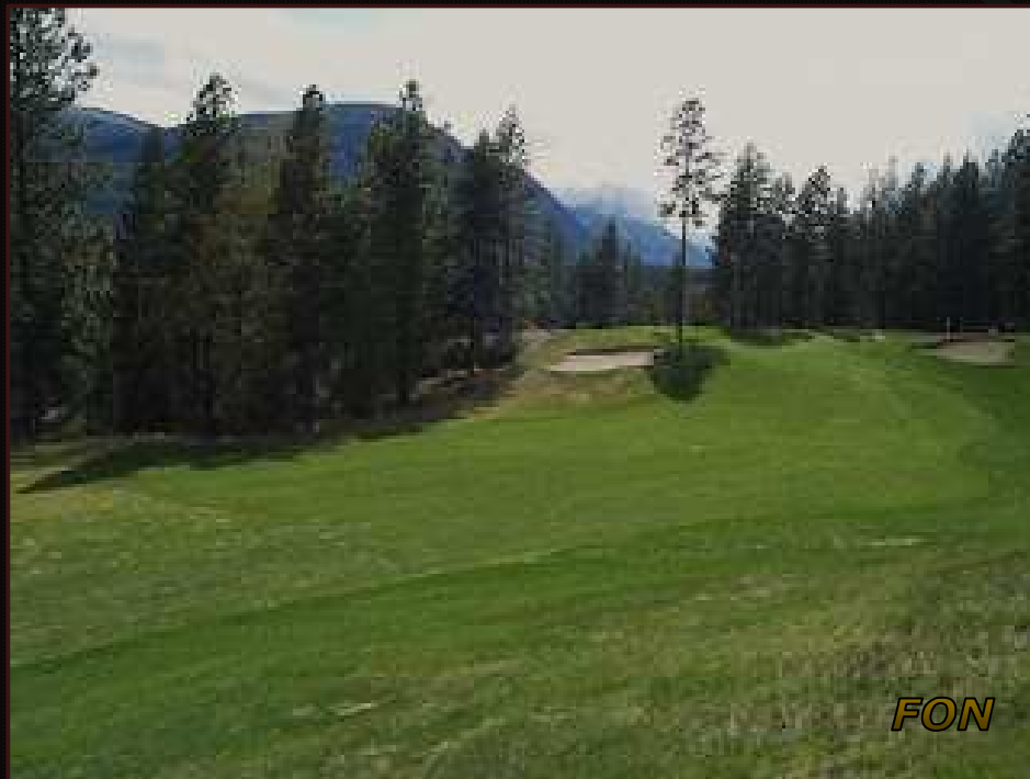
No. 12 Fairway

Had we not treated sections of No. 8, the whole fairway would look like the area in the first picture.