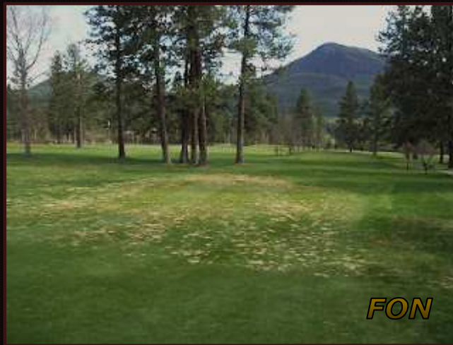
No. 8 Fairway : Not Treated

Avoiding the Destruction of the Golf Industry