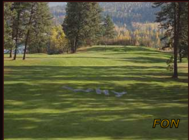
No. 1 Fairway