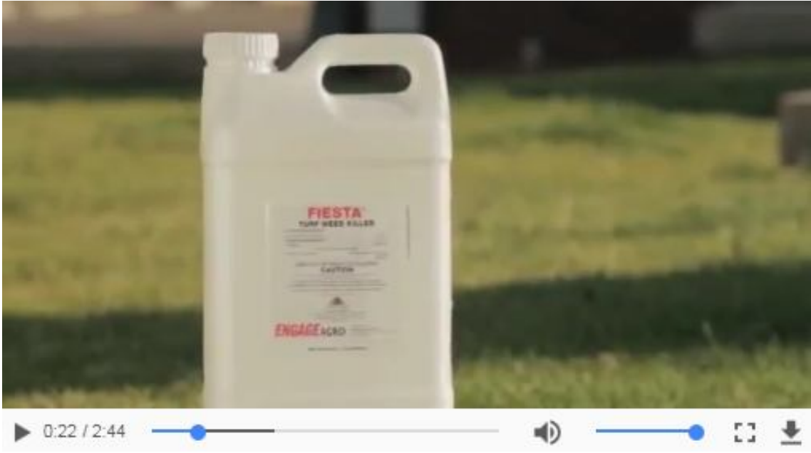
Morden — 2018 00 00 — Covert Advertising Of Fiesta Turf Weed Killer — Video Recording — 2 Minutes 45 Seconds