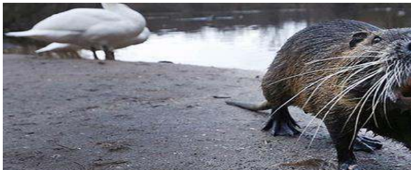
California Scrambles To Contain Infestation Of 20-Pound Rodents ( http://www.idealmedia.com/pnews/2191072/i )