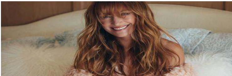
Jane Seymour, 67, Poses For Playboy, Discusses Sexual Abuse ( http://www.idealmedia.com/pnews/2193620/i/3429/pp/2/1/? )