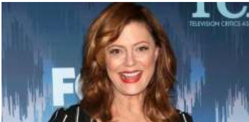
Celebrities You Would Never Believe Are 70+ ( http://www.idealmedia.com/pnews/2163016/i/3429/pp/3/1/? )