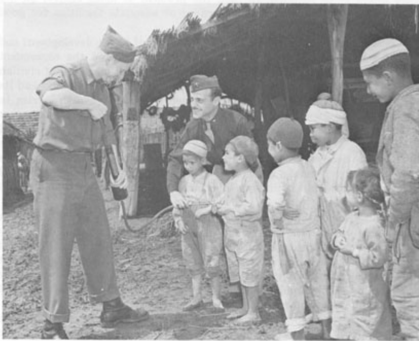
FIGURE 37.—Medical Section personnel of the Mediterranean Base Section in Algiers treat Arab children with new insecticide powder designed to kill typhus lice.

Indeed, DDT was the safest pesticide ever known to mankind. Furthermore, it was inexpensive and could be widely used in third-world countries to control the spread of insect-borne diseases.