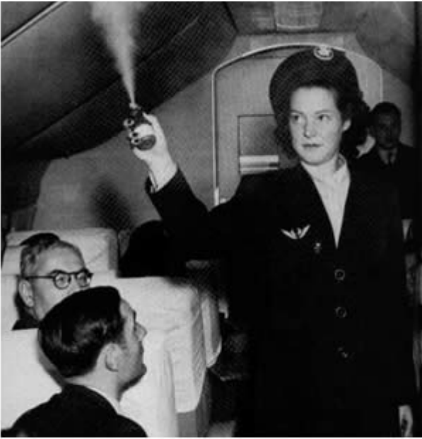
Flight attendant sprays DDT in an airplane cabin.

Surely we would have heard about all the people succumbing to cancer and nervous system-type illnesses if the allegations made in Carson's book were true. They not only crop dusted with DDT, but they sprayed it inside airline cabins, exposing all of the passengers.