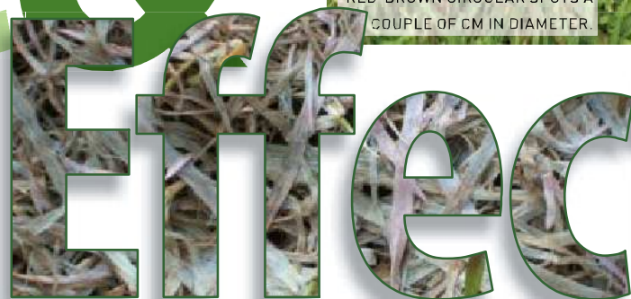
1. FUSARIUM PATCH IN THE FALL STARTS AS SMALL ORANGE TO RED-BROWN CIRCULAR SPOTS A COUPLE OF CM IN DIAMETER.

Microdochium patch, Fusarium patch and pink snow mold are all caused by the fungus Microdochium nivale . There was an attempt in the late 1990s to change the names of all these diseases to pink snow mold. This caused an awkward situation for regions that very seldom experience snowfall, yet were having outbreaks of what was being called a snow mold disease. More recently, there has been a trend, especially in the U.S., to use the name