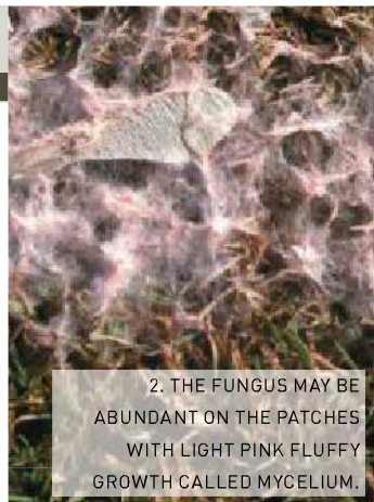
2. THE FUNGUS MAY BE ABUNDANT ON THE PATCHES WITH LIGHT PINK FLUFFY GROWTH CALLED MYCELIUM.