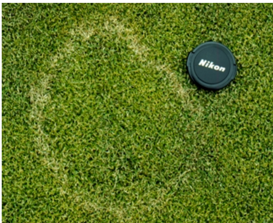
SYMPTOMS OF YELLOW PATCH ON CREEPING BENTGRASS PUTTING GREEN.

Maintaining adequate levels of soil nutrients will help turf resist severe thinning by this disease. Improved surface and subsurface drainage will aid in reducing surface moisture that provides favorable conditions for disease development. Also, timely removal of winter greens covers will help surface drying and will reduce some disease incidence. Light applications of nitrogen fertilizer in the spring will quicken turf recovery from this disease.