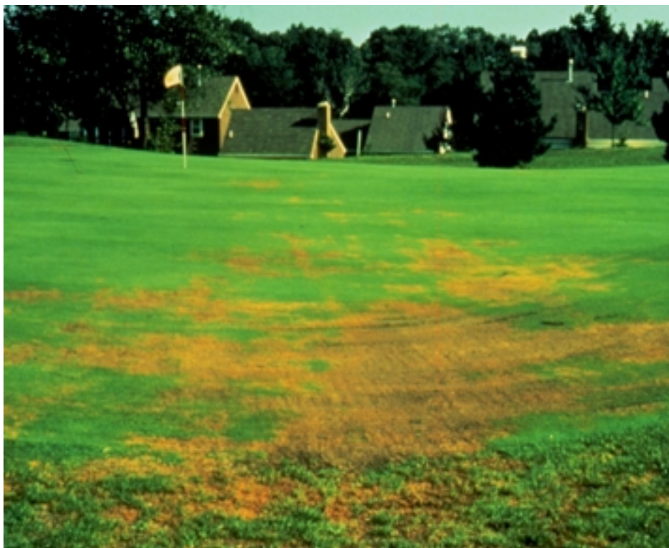
SYMPTOMS OF PYTHIUM BLIGHT ON CREEPING BENTGRASS PUTTING GREEN.

Pythium fungi may survive for long periods in the soil. In turf with a history of Pythium blight, infected plant debris from the previous season or fungus spores in the soil