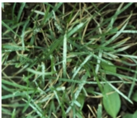
SIGNS OF POWDERY MILDEW FUNGUS ON KENTUCKY BLUEGRASS.

Where occurrence of powdery mildew is frequent, changing landscape plantings to improve air drainage and reduce turf shading will aid in disease reduction. Prune overstory trees to allow sunlight to reach the turfgrass. Turfgrass species differ in their susceptibility to powdery mildew. Kentucky bluegrass, for example, is quite susceptible to this disease, whereas