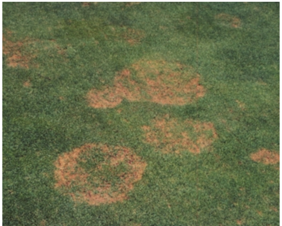
SYMPTOMS OF SUMMER PATCH DISEASE ON ANNUAL BLUEGRASS PUTTING GREEN.