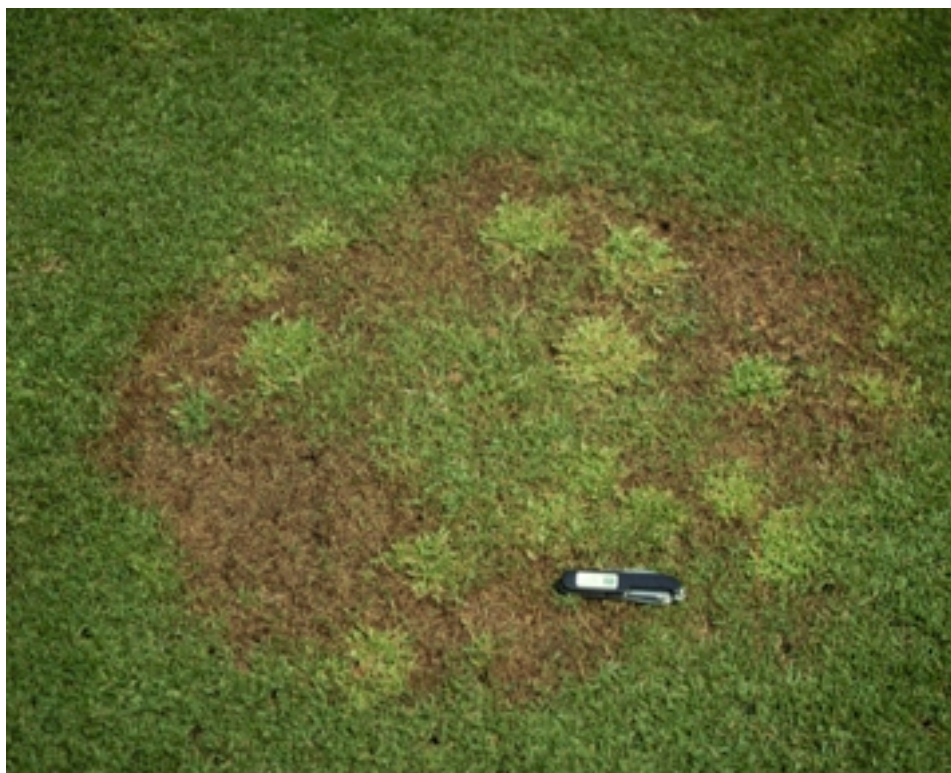
SYMPTOMS OF TAKE-ALL PATCH ON CREEPING BENTGRASS FAIRWAY.

Dead or dying roots may be covered with dark brown strands of fungus (runner hyphae), and dark brown to black mats of fungal growth may be present on the stem