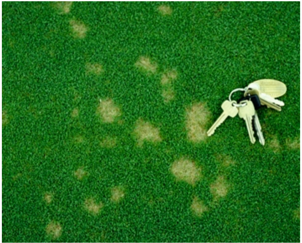
SYMPTOMS OF DOLLAR SPOT DISEASE ON CREEPING BENTGRASS PUTTING GREEN.

On golf course greens cut at or below 3/16 inch, this disease appears as white or tan spots of dead turf about the size of a silver dollar. Hence the name dollar spot. On home lawns cut at 1 to 3 inches, dead areas may reach 2 to 4 inches