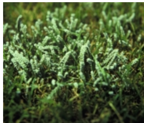
SPORE MASSES OF SLIME MOLD FUNGUS ON KENTUCKY BLUEGRASS LAWN.

Grass blades and the surface of the soil may be covered with a translucent slimy, creamy-white growth. In a few days, this slimy growth changes to pinhead-sized masses of various colors (usually gray or blue). The affected areas may be