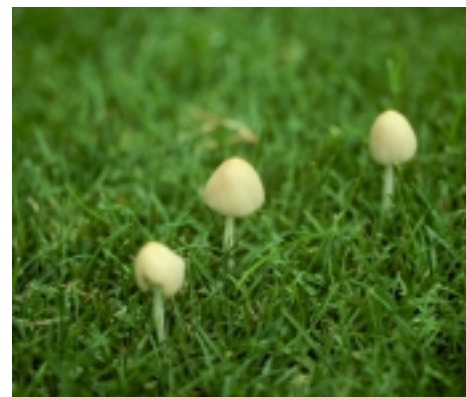
MUSHROOMS PRODUCED BY FAIRY RING FUNGUS.