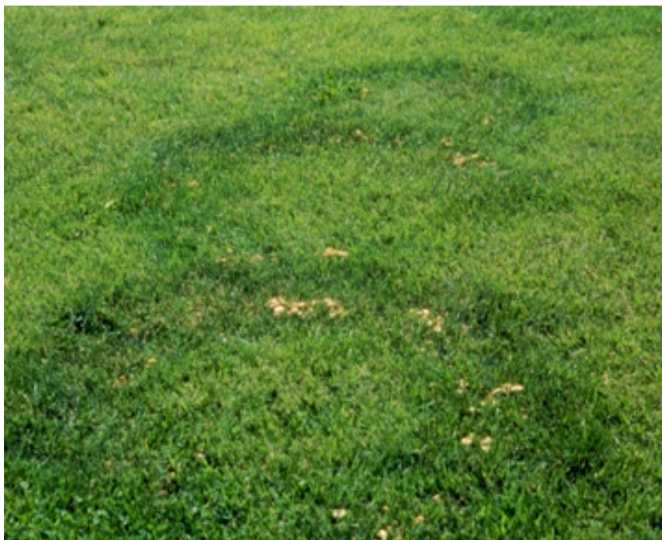
SYMPTOMS OF FAIRY RING ON HOME LAWN.

systemic fungicides has occurred with Sclerotinia homoeocarpa , using contact fungicides in a control program is suggested.