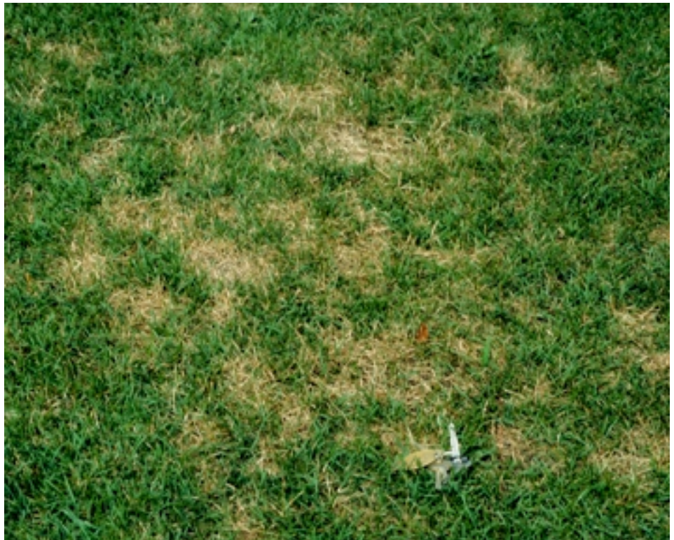
SYMPTOMS OF DOLLAR SPOT DISEASE ON KENTUCKY BLUEGRASS LAWN.

in diameter. These spots may run together, producing large areas of dead turf. Affected leaves initially show yellow-green blotches, which progress to a light straw color with a reddish-brown margin. Occasion-