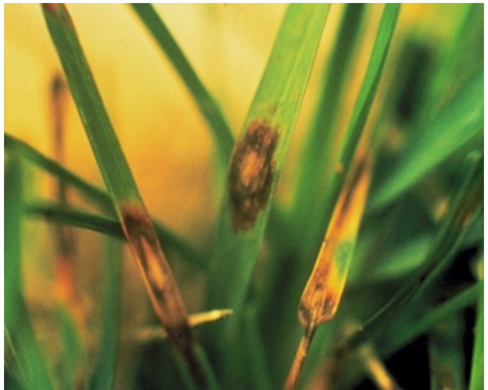
SYMPTOMS OF LEAF SPOT DISEASE ON KENTUCKY BLUEGRASS.

Leaf spot and melting-out diseases are incited by a group of fungi in the genera Bipolaris , Drechslera , and Exserohilum . These fungi used to be referred to as Helminthosporium and many individuals still use this name for convenience. Every cool-season grass species probably has a leaf spot/melting-out disease associated with it, but Kentucky bluegrass is particularly susceptible. These organisms, under pasture and native grassland conditions, cause leaf spots of little consequence. However, as cutting height is reduced and the nitrogen level increased, leaf spot diseases may become so severe that complete loss of the turf can occur.