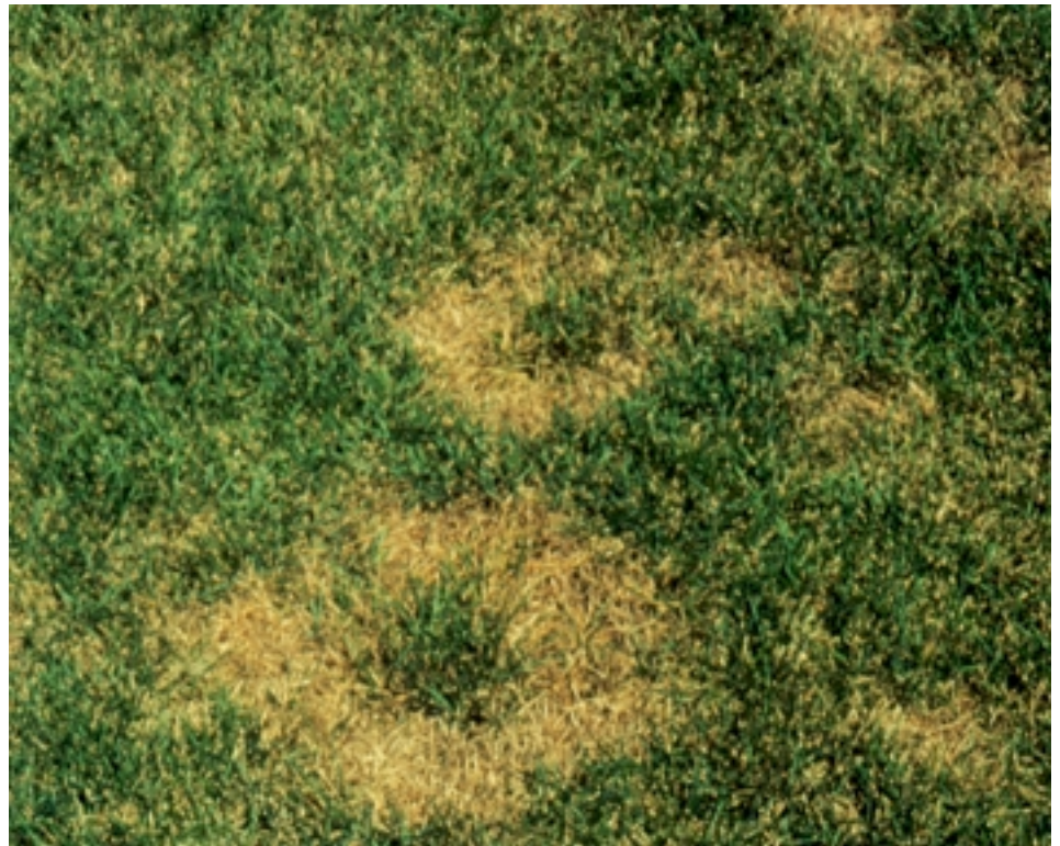
SYMPTOMS OF SUMMER PATCH DISEASE ON KENTUCKY BLUEGRASS LAWN.

The causal fungus, Magnaporthe poae , colonizes grass roots in advance of disease causing activities. When conditions are favorable for disease activity, the fungus will invade the roots. Summer patch commonly occurs in midsummer during extended periods of high temperatures (>82° F) following wet weather or heavy irrigation. The disease does not appear during the cool weather of spring and fall. Summer patch is more frequently observed in areas that receive heavy traffic, poor air circulation, and inadequate drainage.