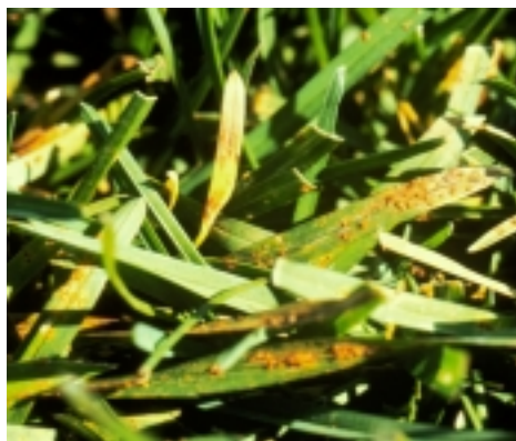
SIGNS OF THE CAUSAL FUNGUS OF RUST DISEASE ON KENTUCKY BLUEGRASS.

The cycle of development for rust diseases is quite complex. Of the dozen or so species of rust fungi that affect turfgrasses, all but three go through five distinct spore production stages. Some of these stages, which are necessary for the completion of the entire life cycle, must occur on plants that are unrelated to the grasses. For a specific rust species, completion of the rust life cycle may require grasses and woody shrubs or grasses and herbaceous ornamental plants. In general, rust diseases do not kill turfgrasses, but may weaken them to the point that they become more susceptible to stress-related problems.