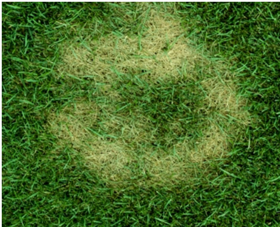
SYMPTOMS OF NECROTIC RING SPOT DISEASE ON KENTUCKY BLUEGRASS LAWN.

Necrotic ring spot is one of three patch diseases caused by root pathogens that are problems of cool-season turfs. The other two are summer patch of bluegrasses and fine fescues and take-all patch of creeping bentgrass. Though not all caused by the same fungus, these