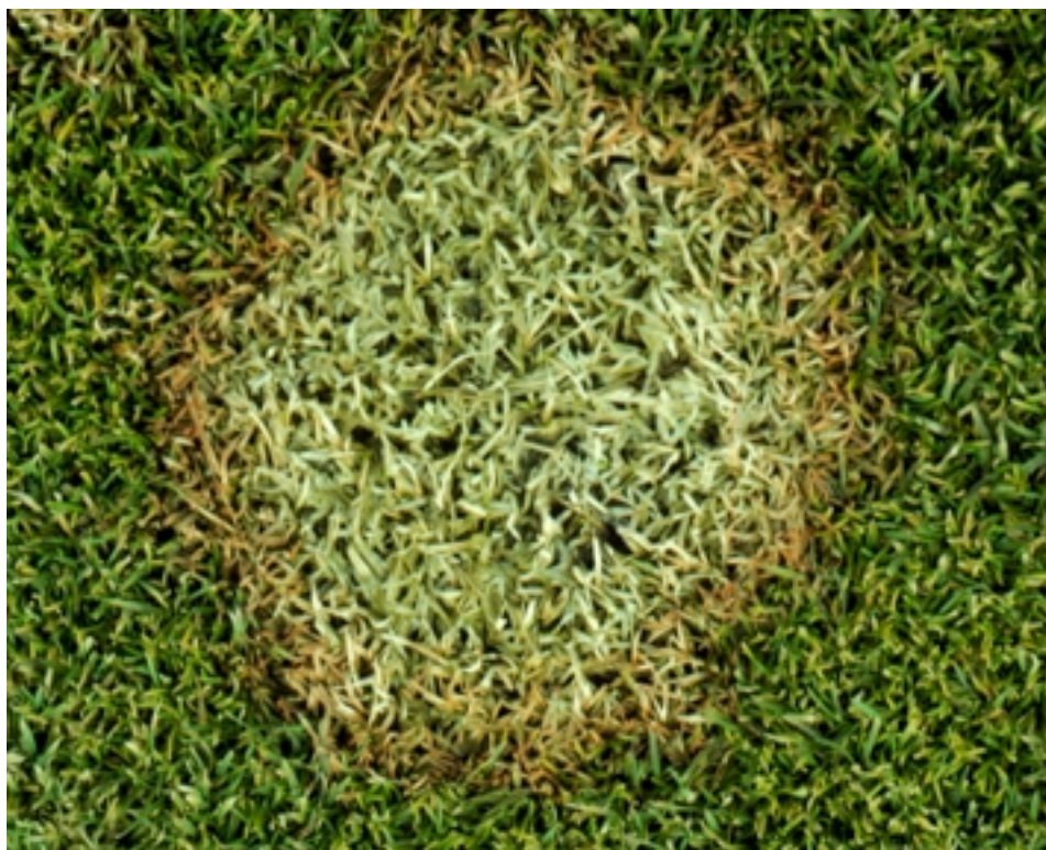
SYMPTOMS OF PINK SNOW MOLD ON ANNUAL BLUEGRASS PUTTING GREEN.

Pink snow mold is a true snow mold since it develops under snow cover. The disease gets its name from the accumulation of pink fungal spores that pile up on the leaves of infected grass plants, producing a pink cast on circular patches of matted grass. Usually only leaves are attacked, but under conditions favorable for disease development the fungus may kill the crowns and roots as well. Thus, pink snow mold can be more severe than gray snow mold. Fusarium patch is similar in appearance to pink snow mold except that the centers of the patches are not usually as matted. Often, a fluffy growth of mycelium can be observed around the periphery of the patch. During periods of cool, wet weather from October to April,