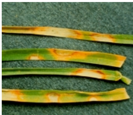
DOLLAR SPOT LESIONS ON KENTUCKY BLUEGRASS LEAVES.

On irrigated turf with persistent dollar spot problems, fungicides are very effective against most forms of the causal fungus. Fungicides are almost always applied on a curative basis for controlling dollar spot. Both contact and systemic fungicides are effective in controlling this disease. Because resistance to certain