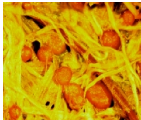
SCLEROTIA OF TYPHULA INCARNATA , CAUSE OF GRAY SNOW MOLD.

of greatest snow accumulation, such as along driveways or over the brink of a hill where snow drifts tend to accumulate. The most notable symptoms are white crusted areas of grass in which blades are dead, bleached, and matted together. These bleached areas range from several inches to several feet across. The chief diagnostic feature of gray snow mold is the presence of hard pinhead-sized fungal bodies called sclerotia. These light to dark brown sclerotia are embedded in the leaves and crowns of the infected grass plants.