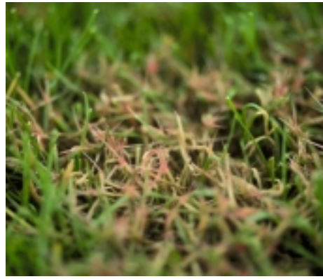
SYMPTOMS AND SIGNS OF RED THREAD DISEASE ON PERENNIAL RYEGRASS.

In the northeast United States, bentgrasses and ryegrasses may need fungicide protection. Timing of fungicides is important. If continued hot, wet weather is expected, the