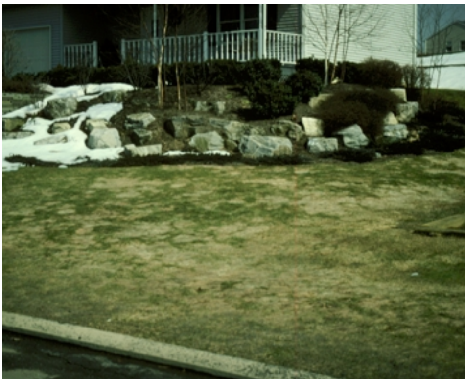
GRAY SNOW MOLD ON HOME LAWN.

This disease is usually noticed first as the snow melts in the spring. It is commonly found in those turf areas