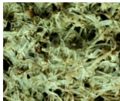
MATTED FOLIAGE OF PINK SNOW MOLD-AFFECTED TURF.

Pink snow mold usually can be managed successfully in home lawns without fungicides provided the lawn has been established for more than a year. Mow on a regular schedule well into the fall, and avoid high unclipped grass that tends to fall over and mat under snow cover. Try to avoid creating snow banks when removing and piling snow from sidewalks and driveways. Straw mulches and piles