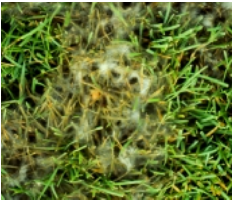
DENSE MYCELIUM OF PYTHIUM APHANIDERMATUM ON TALL FESCUE LAWN.

are sources of infection. Disease development from the first infection centers occurs by growth of fungal mycelium and movement of spores from plant to plant. Under conditions favorable for disease development, Pythium blight can spread very rapidly.