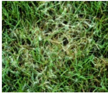
MYCELIUM OF RHIZOCTONIA SOLANI ON PERENNIAL RYEGRASS.

Applying nitrogen fertilizers on turf with a known history of brown patch during hot and humid weather may create the need for fungicide applications to control the disease. Removal of dew or guttation water that collects on the grass leaves each morning has proven effective as an aid in reducing brown patch. This removal can be achieved by mowing or by dragging a water hose across the area. Necessary watering should be done in time for the grass to dry before nightfall.