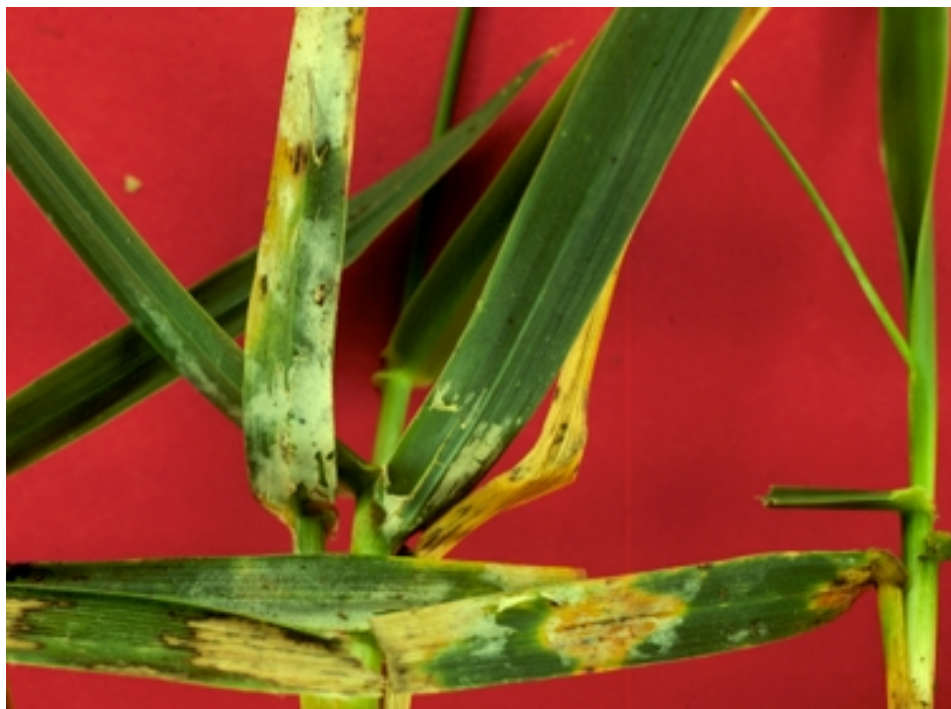
SYMPTOMS OF BROWN PATCH ON TALL FESCUE LEAVES. NOTE IRREGULAR, LIGHT BROWN LESIONS WITH DARK BROWN BORDERS.

in the patch. Sometimes, all the grass within the patch is killed, creating a sunken or "pocket" effect. More often, the turf in these patches is thinned rather than completely killed. Occasionally, no circular