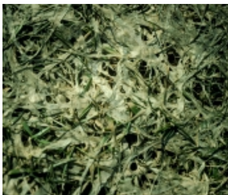
MATTED LEAVES OF GRAY SNOW MOLD-AFFECTED TURF.

of greatest snow accumulation, such as along driveways or over the brink of a hill where snow drifts tend to accumulate. The most notable symptoms are white crusted areas of grass in which blades are dead, bleached, and matted together. These bleached areas range from several inches to several feet across. The chief diagnostic feature of gray snow mold is the presence of hard pinhead-sized fungal bodies called sclerotia. These light to dark brown sclerotia are embedded in the leaves and crowns of the infected grass plants.