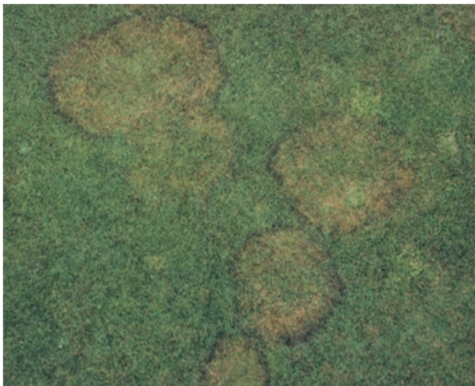
SYMPTOMS OF BROWN PATCH ON CREEPING BENTGRASS PUTTING GREEN. NOTE DARK RINGS AROUND PERIPHERY OF PATCH (SMOKE RINGS).

On high-cut turf, patches may be up to several feet in diameter and circular. In early morning on dew-covered turf, white mycelium of the causal fungus can often be seen on and between grass leaves and stems