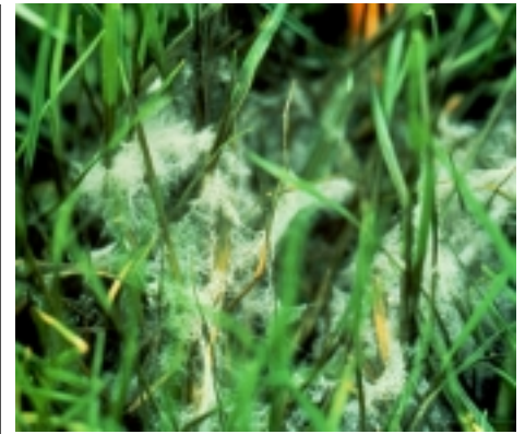
DENSE, WHITE MYCELIUM OF DAMPING-OFF FUNGUS ON SEEDLING TURF.

Seedlings become blighted, then collapse and die, forming circular or irregular patches. Affected plants often appear water soaked and slimy. Sometimes mycelium can be seen on dew-covered grass in early morning. The dead tissue may mat together somewhat like paper-mache and form a crust over the soil surface.