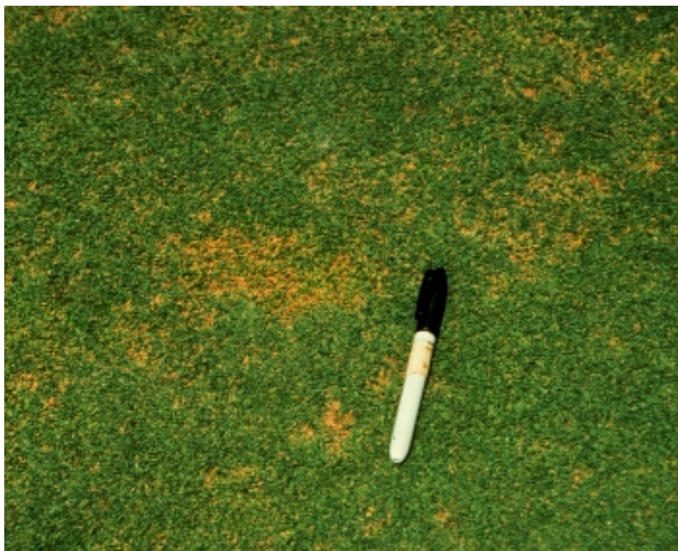
ANTHRACNOSE BASAL ROT SYMPTOMS ON ANNUAL BLUEGRASS PUTTING GREEN.

The causal fungus, Colletotrichum graminicola , survives the winter as dormant resting structures called sclerotia and as dormant mycelium in infected plant debris. During early spring outbreaks of anthracnose basal rot, the fungus, which may have overwintered in the plant, initiates infection at the base of the plant. Outbreaks of anthracnose foliar blight and/or basal rot can result when spores produced in acervuli are dispersed by splashing water or tracked by mowing equipment from one area to another. These spores then germinate and cause new infections on other