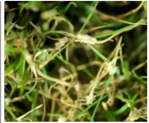
SYMPTOMS AND SIGNS OF PINK PATCH DISEASE ON PERENNIAL RYEGRASS.

Diagnosis of red thread is most certain in the advanced stages of disease development, when bright thread-like coral pink fungus mycelium, 1/16 to 1/4 inch in length, are produced at the tips of the affected leaves. In the case of pink patch, affected leaves are covered with the pink fluffy growth of the causal fungus.