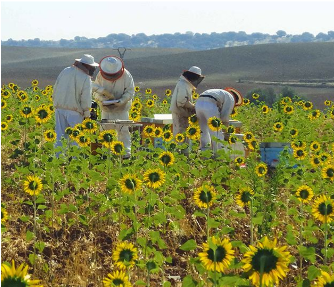
Bayer scientists in field during neonics study.

Other research tells a different story — notably the UK’s Center for Ecology and Hydrology August 2016 study modeling neonic impacts on wild bee populations in England and David Kleijn’s team’s June 2015 study of crop pollination services by wild pollinators ) showing that Bombus terrestris , among other bee species that forage on neonic-treated oilseed rape crops, hadn’t even declined, much less started toward extinction.