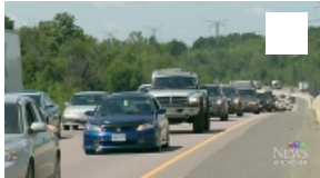
CTV Kitchener: 401 at a standstill