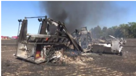
Nearly 100 firefighters respond to large field fire near Caledonia

NEW Brazil police arrest man suspected of plans to attack Rio Olympics