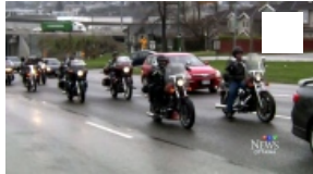
CTV Ottawa: Playing host to Hells Angels