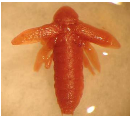
Figure 1. Pupa infected by H. bacteriophora (dorsal view).

In laboratory experiments, various nematodes species/strains were tested against field-collected adult ABW. Only the commercial and field isolates of S. carpocapsae (both 58%) and H. bacteriophora