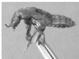
Figure 3. Rove beetles have been reported to be predators of various white grub species.

discovered that are more potent against white grubs. A newly discovered strain (GPS11) of H. bacteriophora from a golfcourse in Ohio applied at 1 billion nematodes per acre gave 73% control of the mature Japanese beetle grubs in turfgrass in fall of 2000 (Fig. 3).