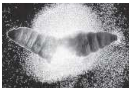
Figure 1. Tens of thousands of infective juveniles of the beneficial nematode Steinernema carpocapsae spilling out of a wax moth larva in search of new hosts.

The keys to success with beneficial nematodes are: (1) understanding their life cycles and functions; (2) matching the correct nematode species with the pest species; (3) applying them at the right time; (4) using them under