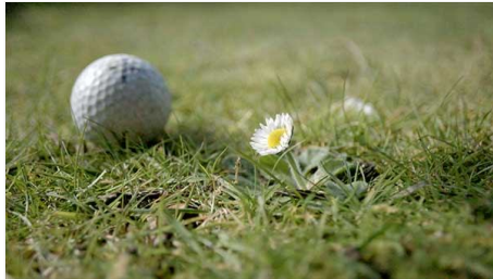
Can we live with a few weeds on the golf course?