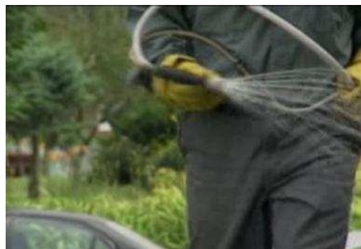
Critics are slamming the findings of a recent report, which encourages Edmonton not to follow in the footsteps of many other Canadian cities that have banned the use of pesticides.

Recommend Be the first of your friends to recommend this.