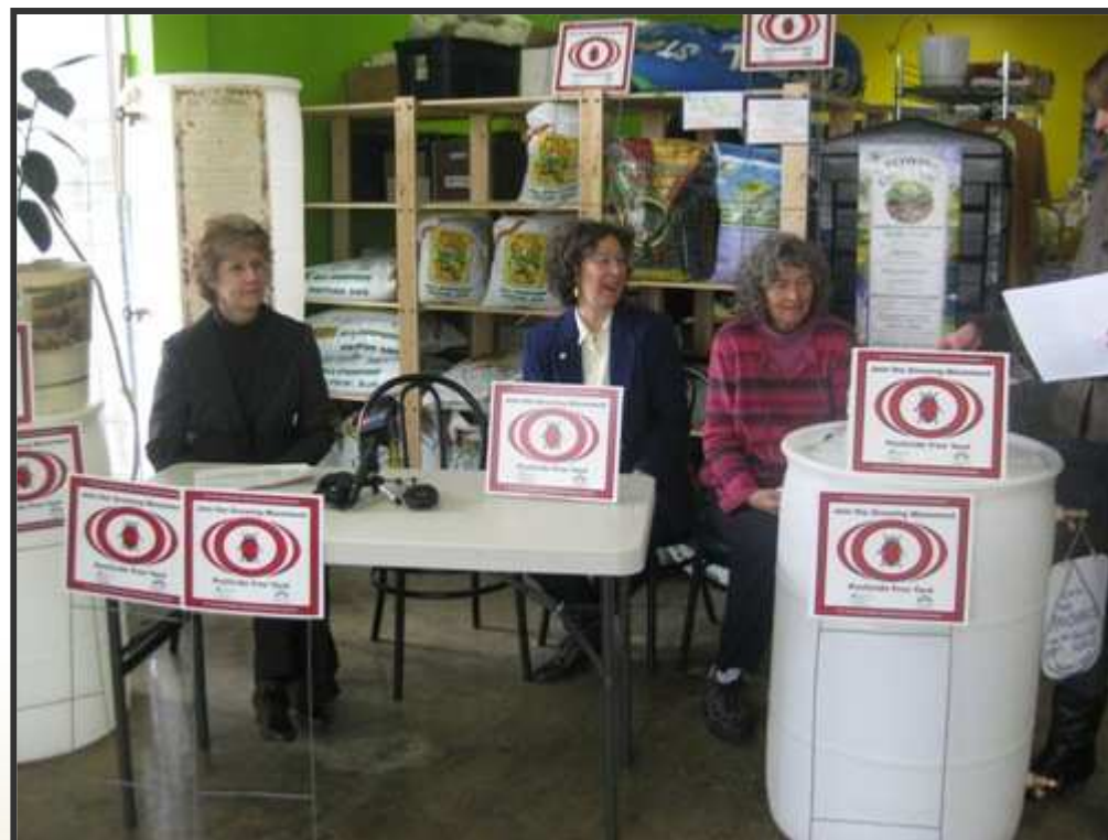
The coalition contends a municipal bylaw is the best way to ensure that doesn't happen and they're urging Edmontonians to contact their city councillors.