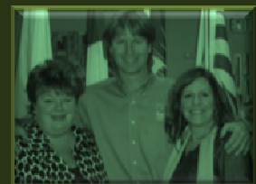
ILLEGAL For-Profit Lobbying

Conducting business in Canada without disclosing payments of TENS OF THOUSANDS OF DOLLARS as a PRESENTER and SPEAKER for Canadian Cancer Society and Ecojustice Canada.