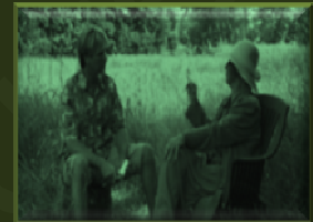
For-Profit Video Production

Entering Canada without declaring the intention to GENERATE REVENUES while CONDUCTING BUSINESS involving VIDEOS, BOOKS, LOBBYING, PRESENTATIONS, and PUBLIC SPEAKING.