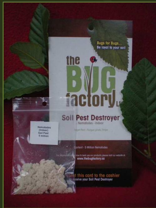
Above: Shot of an entomo-pathogenic nematode; and a typical Canadian package of nematodes for garden use