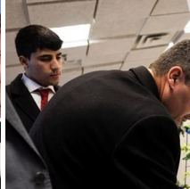
Memorial service held for Ontario woman killed in Istanbul terror attack