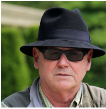
Along the Fraser: Here's to a better year in 2017