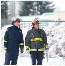
Woman takes to Surrey tree