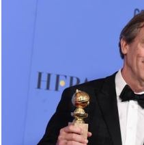
Politics mentioned early and often at Golden Globes