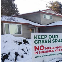
Some Sunshine Hills residents concerned over plan to re-zone the North Delta neighbourhood