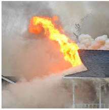
Fire rips through South Surrey home