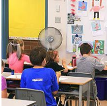
UPDATE: 1,100 teachers to be hired in interim staffing deal