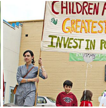
Student teachers relieved as hundreds of new positions to open following BCTF's interim deal