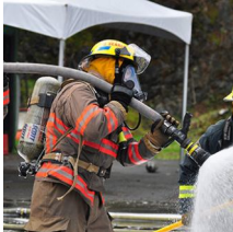
A Year in Review: Here's a recap of what happened in the Sooke Region over the last year