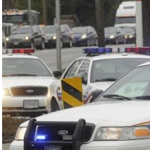
Nanaimo RCMP arrest two suspects in rash of smash-and-grab robberies