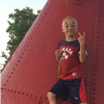
Community shows support for family in need