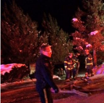
House fire in Black Mountain neighbourhood