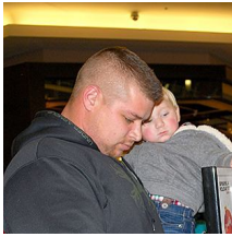
A Langley shopping night brought holiday cheer to 21 local charities