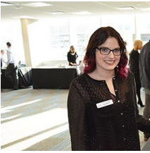
A HUB of health-tech companies creates a buzz near Surrey Memorial Hospital