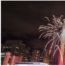
VIDEO: How to keep New Year's resolutions without breaking the bank