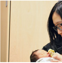
Baby girl born to Nanaimo family first of the year on Vancouver Island