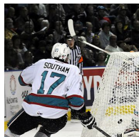
Southam nets three to pace Rockets to Game 5 win