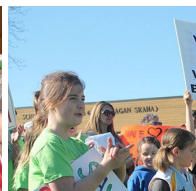
Parents and students rally at school board office