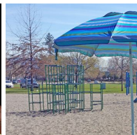
Kelowna inventor to appear on Dragons' Den