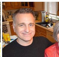
Cannabiz oil a saving grace for Lake Country woman after end of life diagnosis