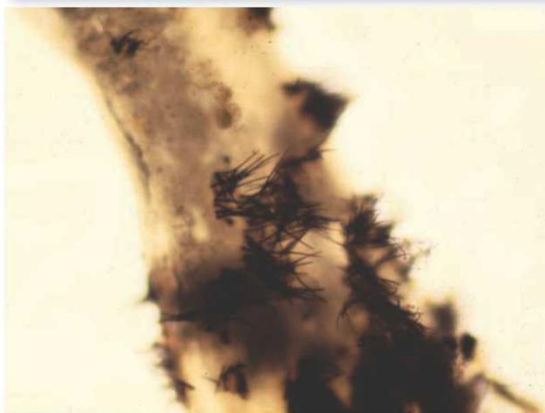
Deterioration of annual bluegrass plants due to severe infection of crown, roots and stem tissue by Colletotrichum cereale (top) and profuse production of acervuli on the stem (bottom).

was applied to the turf with a hand-held sprayer. Inoculation was conducted in the late afternoon (before sunset), and the turf was covered with a 6-mil plastic sheet for three consecutive nights; the cover was removed each morning. A total of seven assessments of anthracnose basal rot severity (using an index of 0-10, where 0 is asymptomatic turf and 10 is more than 90% symptomatic turf) were made on May 24, 27 and 30, June 2, 5 and 8 and July 14. Symptomatic plants were randomly collected from the plots and evaluated for the presence of acervuli, conidia and setae on the affected tissues.