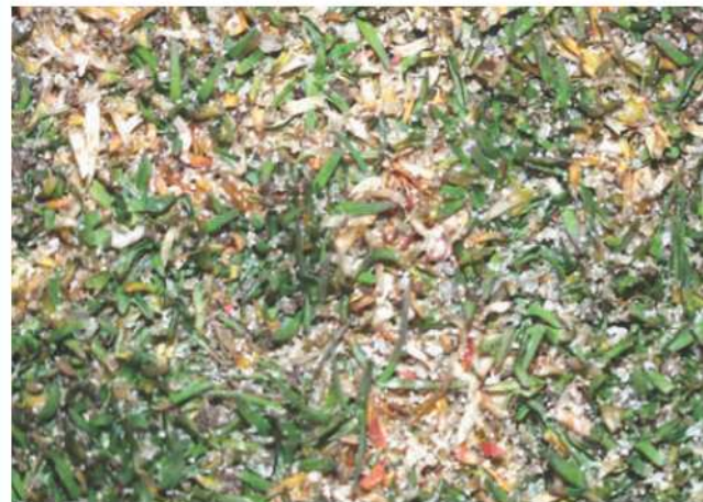
Development of basal rot anthracnose in mixed annual bluegrass and creeping bentgrass putting greens.

Studies have shown that increased severity of anthracnose basal rot disease in annual bluegrass