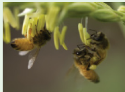
Honeybees collecting pollen

Mitigation measures. In the interim, the Pest Management Regulatory Agency implemented several measures for the corn and soybean planting seasons in 2014 and 2015, including the use of dust-reducing seed planting practices and new product labels with enhanced warning statements.