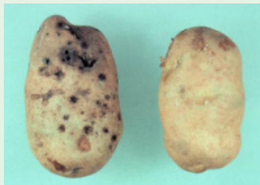
A damaged potato from late summer wireworm feeding (left) compared with a healthy one (right).

Phorate is an active ingredient that was registered in Canada in 1962. The Pest Management Regulatory Agency (the Agency) initiated a re-evaluation of phorate in 1999 and completed it in 2004. The re-evaluation concluded that this insecticide had high acute toxicity and posed risks that made it unacceptable for all uses. Its effects on the environment could not be mitigated, because even small doses could be harmful.