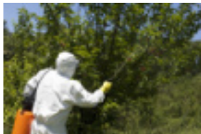
Use of personal protective gear to mitigate risks to pesticide user

1.36 All 10 of these re-evaluations resulted in changes to the instructions on product labels to mitigate risk and ensure the application of current standards and practices. For example, the revised instructions specified the need for buffer zones between fields and streams, or additional personal protective gear. In 2 of these re-evaluations, the active ingredients were found to pose unacceptable risks to human health, and certain uses of the products were cancelled as a result.