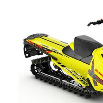
Ski-doo snowmobile stolen from Revelstoke