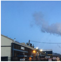
UPDATE: Body of man who died at Tolko Mill recovered