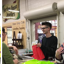
Eclectic events attract sippers and shoppers