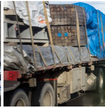
Residents protest unsafe drivers