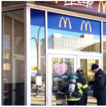
Customers pepper sprayed at McDonald's