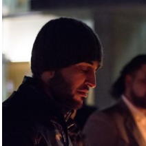
Group gathers to mourn victims of shooting