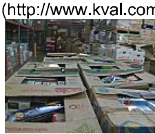
Stuff the bus this Friday and Saturday

( http://www.kval.com/news/local/30-years-ago-today-Autzen-sniper-killed-1-injured-1-282487171.html )