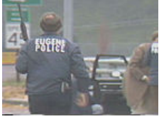
30 years ago: Autzen sniper killed 1, injured 1