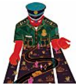
A Maddening Bargain With a Mexican Police Officer The New York Times

the-stories-behind-america-s-worst-serial-killers) ( http://www.nytimes.com/2014/11/09/travel/a-maddening-bargain-with-a-mexican-police-officer.html )