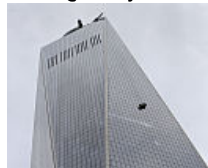
Workers rescued from dangling World Trade Center scaffolding

( http://www.kval.com/news/local/282480801.html ) ( http://www.kval.com/news/local/Will-it-snow-in-Oregon-Portland-Eugene-Salem-Albany-Corvallis-Gorge-Hood-River-282460301.html ) ( http://www.kval.com/news/local/Workers-on-dangling-World-Trade-Center-scaffolding-282449941.html ) ( http://www.escapehere.com/destination/the-10-most-dangerous-cities-in-the-us/ ) ( http://www.viralnova.com/grandpa-passed-away-trunk-gallery/?mb=out ) ( http://learn.st/users/580043/boards/85691-