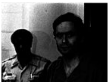
The Stories behind America's Worst Serial Killers Learnist

the-stories-behind-america-s-worst-serial-killers) ( http://www.nytimes.com/2014/11/09/travel/a-maddening-bargain-with-a-mexican-police-officer.html )