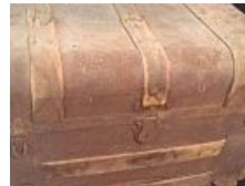
A Grandpa Left a Trunk Behind For His Family - What's Inside is... Viral Nova