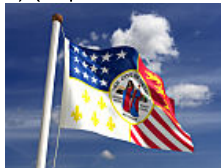
10 Dangerous US Cities You Should Avoid Traveling To EscapeHere