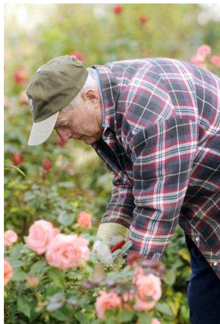
A volunteer gardener attends to the Centennial Rose Garden, outside of Dogwood Pavilion in Coquitlam. City council is considering excluding Fraser Pacific Rose Society, which runs the garden with its 800 plants, from the city's proposed pesticide ban, allowing it to occasionally use chemicals.