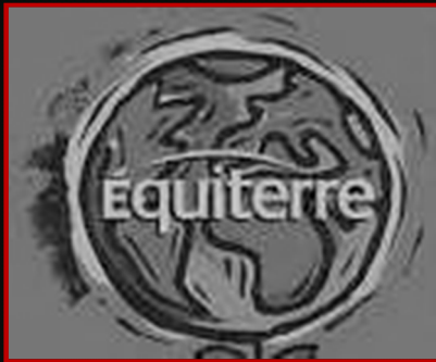
Equiterre ( Quebec )