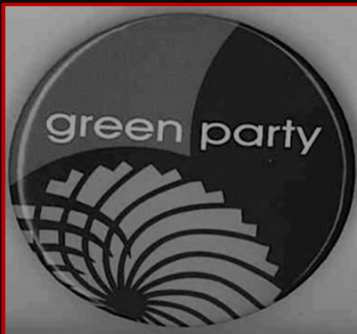
Green Party of Ontario