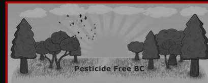
Pesticide Free BC