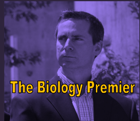
The Biology Premier

Not surprisingly, McGuinty, THE BIOLOGY PREMIER, must feel right at home dealing with his allies from the Environmental-Terror-Movement, since he is, in fact, a BIOLOGIST. We kid you not. He studied BIOLOGY and earned a B.Sc. from McMaster University prior to his completion of a second degree in law. ( Biologists have traditionally NOT been well-informed about pest control products, but they think they know all there is to know. In other words, they know NOTHING about pest control products. ) In 1983, McGuinty became a senior partner at the family law firm.