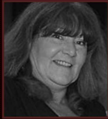
HEPBURN, Lorelei The Environmental Factor