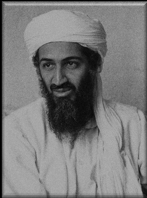
Osama bin Laden