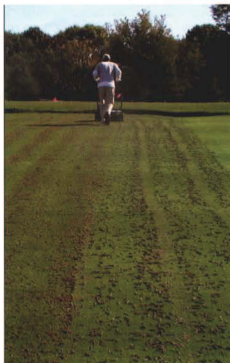
Nutrient and pesticide runoff from fairways can be mitigated using hollow-tine aeration when compared to management with solid-tine aeration.

Chemical analysis of the runoff water revealed a greater than 30% reduction in quantities of phosphorus (soluble-P), ammonium nitrogen ( NH_4-N ), and nitrate nitrogen ( NO_3-N ) measured in the runoff from turf plots aerated with hollow tines 2 days prior to initiation of the rainfall simulations compared to plots aerated