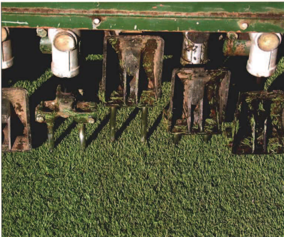
Research at the University of Minnesota determined that solid-tine coring was less effective than hollow-tine coring in reducing runoff losses from fairway turf.

Five weeks following the first rain-fall simulation, all plots were aerified a