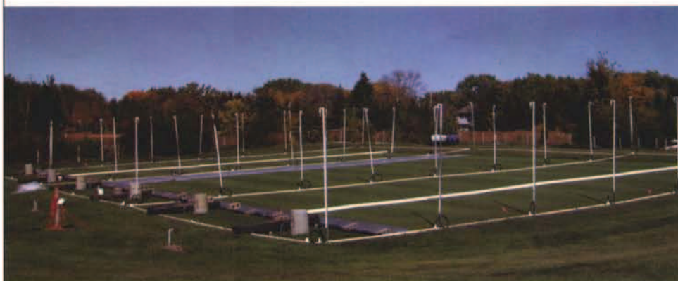
Rain simulators were used to produce runoff 2 and 63 days after aeration treatments. Runoff was then analyzed for 2,4-D, chlorpyrifos, flutolanil, and a potassium bromide tracer.