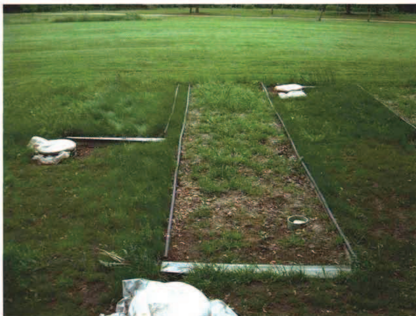
The slower establishment of prairie vegetation allowed annual weeds and grasses to dominate in the research buffer strip plots.

Turf is often used as a ground cover throughout inhabited areas, including golf course roughs, because it is relatively easy to establish and maintain, provides contiguous ground cover throughout the year under traffic and mowing, and the low mowing height