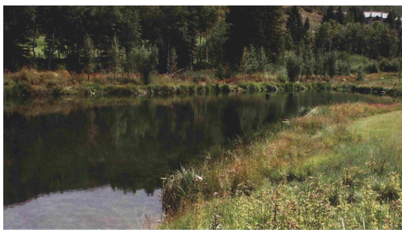
Establishing buffer strips around natural water features on a golf course has long been recommended to protect water quality and improve wildlife habitat. Research indicates that dense turf vegetation is effective at reducing runoff.

with recommendations for prairie establishment. Fairways received 108 to 216 lb. N acre -1 annually in one or two applications (spring and fall), with approximately 5.5 to 11 lb. P acre -1 each year. Fairways received little to no irrigation, so snow melt and rainfall provided the source of runoff water. The 9th fairway remained flooded from excessive rainfall throughout