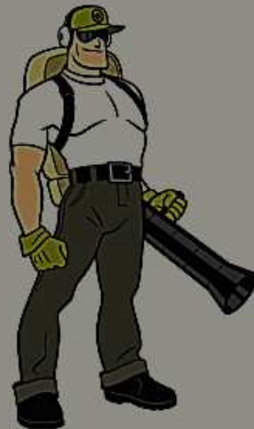
Dread Skeeter, the mosquito eliminator