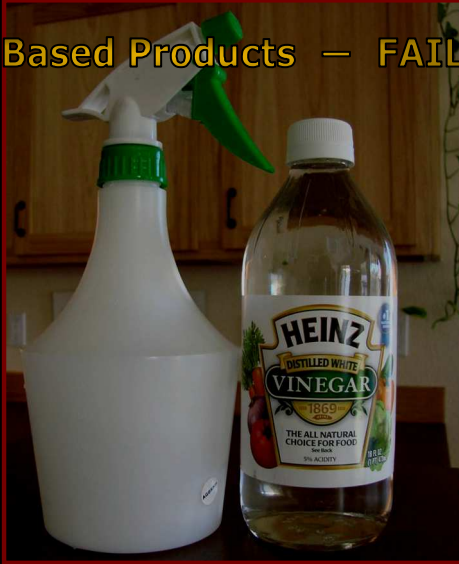
Vinegar-Based Products — FAILURE