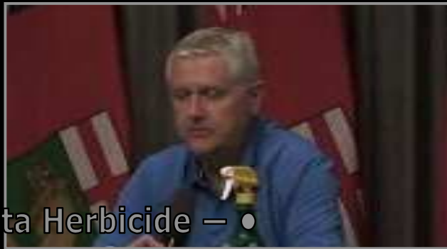
Bottle of Fiesta Herbicide – ●