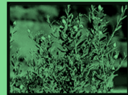
Toxicity of our Herbicides

All products are rated to an "LD 50" rating system relative to their toxicity. The LD 50 scale starts at 001 and runs to 10,000: The lower the number, the more toxic the product. The herbicides our company uses start at 1000 and go as high as 7500. To give a point of reference, Aspirin has an LD 50 of 1,000; table salt an LD 50 of 3,320.