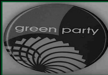
Green Party of Ontario