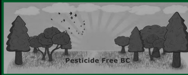
Pesticide Free BC