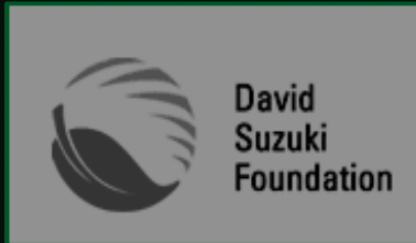
David Suzuki Foundation