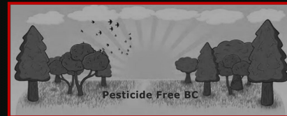
Pesticide Free BC