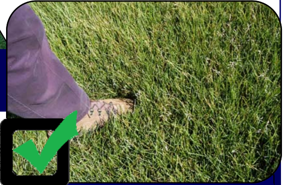
My Holiday Lawn™, shown here one month after summer mowing

Jacklin Seed by Simplot is excited to introduce My Holiday Lawn™, a Kentucky bluegrass that can be mowed as little as ONCE A MONTH, as opposed to the 1 or 2 mows PER WEEK current normal lawngrasses require.