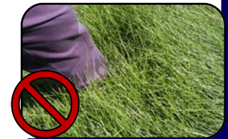
Too Much Top Growth