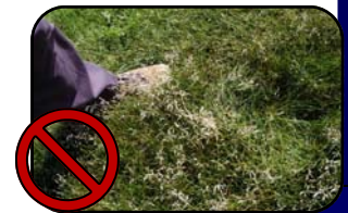
Too Many Seedheads