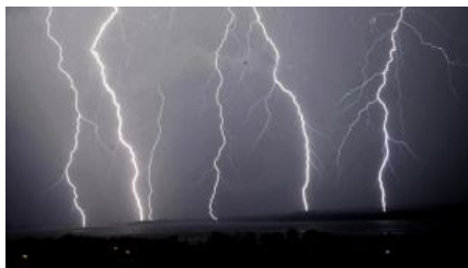
Potentially damaging thunderstorms could sweep South Island late today