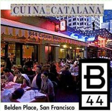
Belden Place, San Francisco

Bay market sponsors help support SFBay! Visit these locally-owned businesses to help us bring you the best of The Bay!