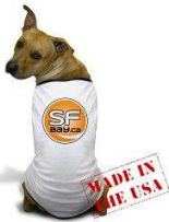
Dog T-Shirt 20 00