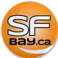
3 5" Button 5 00