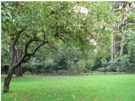
Mode 2 Level B turf in Scobert Gardens, a pesticide-free park in Eugene. “Level B” indicates that the frequency of cultural maintenance is lower than for other Mode 2 turf.

When asked about washing mowers between cuttings to reduce weed seed spreading, Hallett remarked, “Though this practice would be ideal in a more centralized operation, for example golf courses, our operation is spread throughout the city. Logistically, this practice would be unfeasible.” 2