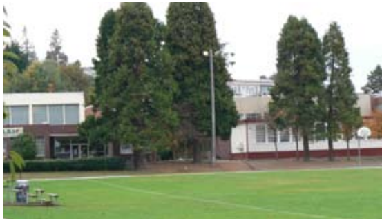
Healthy, weed-minimal turf, despite intense activity in the soccer field in Alki Park, a pesticide-free park in West Seattle