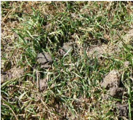
Soil plugs after aeration, following a festival in Bend's Drake Park

newer parks, leaving the rest of the park in a more natural condition with drought-tolerant plant species, like bunchgrasses, juniper, and pine. Because these varieties are not able to withstand heavy foot traffic, a turf area is still needed if park patrons are going to play ball or participate in similar high-impact activities. Watering is performed at night to minimize evaporation except following festivals or other special events that require intense mitigation afterward because of foot traffic. The day after an event, a crew clears dead turf and then aerates, overseeds, fertilizes, and irrigates heavily. 9