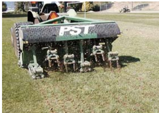
Deep tine aerator used to reduce compaction.

Aeration, using a deep tine aerator to punch holes several inches deep in the soil, is another important cultural method used in Portland’s parks. Although Carr would like to aerate all of Portland’s park turf, due to budget constraints, sometimes only the areas impacted the most by foot traffic, primarily athletic fields, receive aeration (two to three times per year). 4