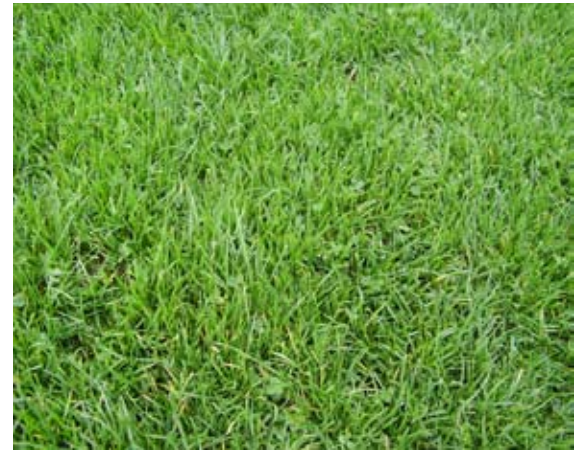
Portland Parks and Recreation tolerates some clover in turf in Arbor Lodge Park, a pesticide-free park in Portland.