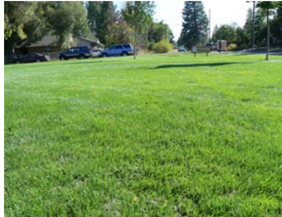
Healthy turf with minimal weeds in Bend's Columbia Park

Right: Compacted, stressed turf following a festival in Julia Davis Park in Boise will receive intensive cultural treatment to restore health and minimize weeds.