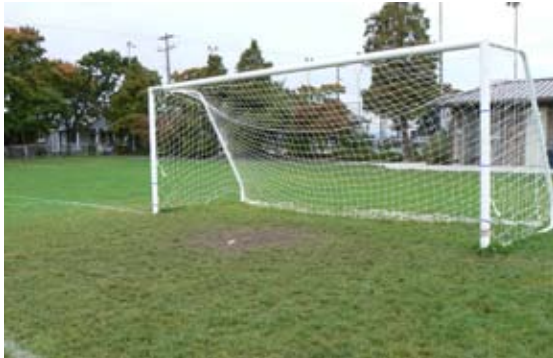
Bare spots created by very intense activity in front of the soccer goal in Alki Park