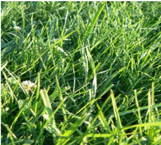
A low percentage of clover is tolerated in turf in most of Boise's parks.

Athletic fields receive regular fertilizer applications and neighborhood parks receive a slow-release fertilizer in October or not at all. Like DeCaro (Seattle), Woodward and Belanger prefer slow-release commercial to organic fertilizer. Woodward notes that the polymer coating around the slow-release commercial fertilizer makes the release rate fairly predictable, depending only on temperature and moisture level.