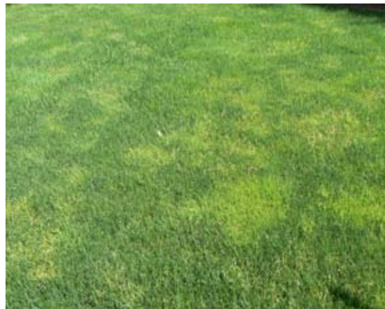
Annual bluegrass, an invasive plant, creates a mottled, or splotchy, appearance.

that emerge from heavy activity, says Hallett. Although other grasses, like annual blue grass, can spread via a massive seed bank, greater susceptibility to drought stress makes them less attractive options. A native grass that Hallett would like to experiment with in dog parks, with their heavy traffic, is Deschampsia caespitosa , which is very tough, like beach grass (non-native), as well as drought-tolerant. 1