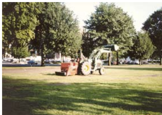
Seedavator used to overseed bare spots in turf.

Parks maintenance personnel also focus on over-seeding in these most-worn areas to re-establish turf, adding 20-25 tons per year of grass seed. The department generally uses a perennial rye blend in sunny areas (1/3 each of: Quick Start II, Brightstar SLT, Manhattan 4), and a 50/50 rye/fescue blend in shaded areas. 5