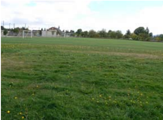
Dandelion seed heads along the periphery in foreground (above) and background (below) (outside of the area designated for management) of the Mode 1 sports field in Ida Patterson Park in Eugene, which can spread to the sports field and make weed control more challenging.