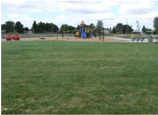
Mode 2 turf in Candlelight Park, a new neighborhood park in Eugene, contains a new cultivar of turf-type tall fescue.

New cultivars of turf-type tall fescue, the grass one might see in a cow pasture, with rough, light-green clumps, have been developed to demonstrate lower-growing and darker-green color characteristics. These new cultivars