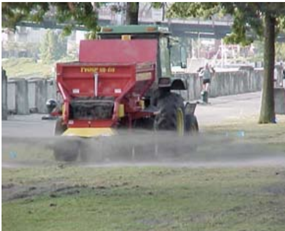
Top dresser used to apply sand or similar material.

"This is a very labor intensive and costly maintenance activity but one that is essential if Portland Parks is going to improve the safety and playability of our sportsfields," says Carr.