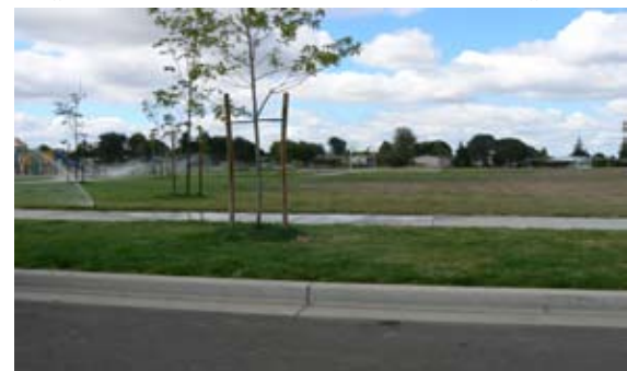
Candlelight Park is irrigated in some parts of the park and not others because of budgetary constraints.

Planning is key. After Eugene’s Candlelight Park was constructed, for example, a budgetary limitation resulted in the decision to irrigate some parts of the park and not others. Even so, the same grasses were planted in all areas of the park. Knowing in advance of construction which areas will be irrigated can be helpful in determining which grasses to plant.